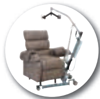
Hoist Friendly Kit SC6030