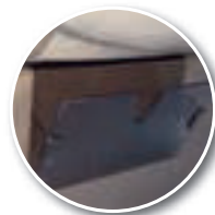
Magazine Holder SC6026