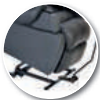
Mobility Kit SC6032