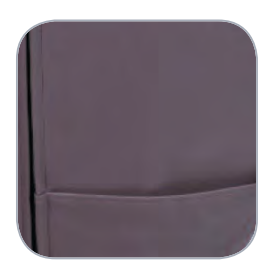
STORAGE POCKET Conveniently carries everyday items such as clip boards, magazines or diaries

trigger lever makes postural adjustment a simple task