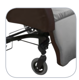
ADJUSTABLE SEAT HEIGHT Seat height can be adjusted by up to 80mm allowing the chair to be used at a desk or dining table