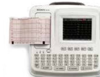
SE-601B (5.6" Color LCD Display)