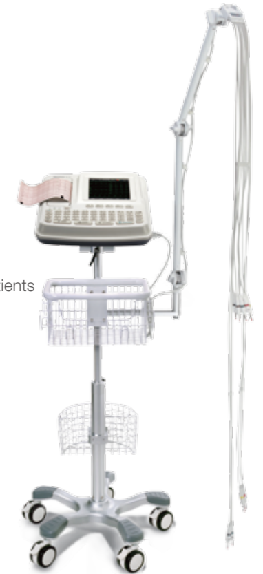
SE-601C With Rolling Stand (5.6" Color Touch Screen)