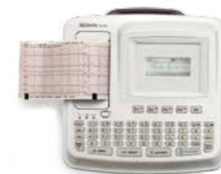
SE-601A (3.5" Monochrome LCD Display)