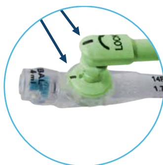
ALIGN & INSERT