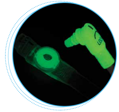
Glow Green™ Facilitates Nighttime Feeds