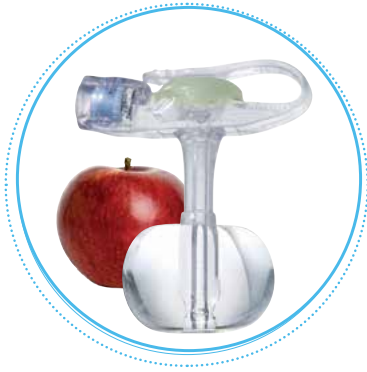
Exclusive AMT Balloon Secure Gastric Seal