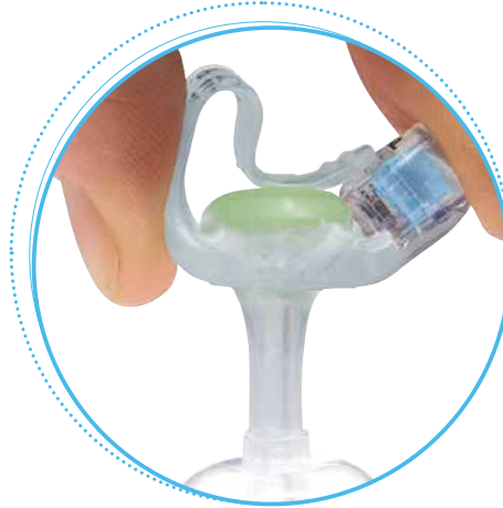
Soft & Flexible Optimised for Comfort