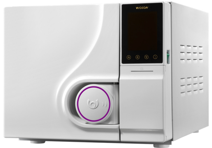
23 Litre B class Touch Autoclave